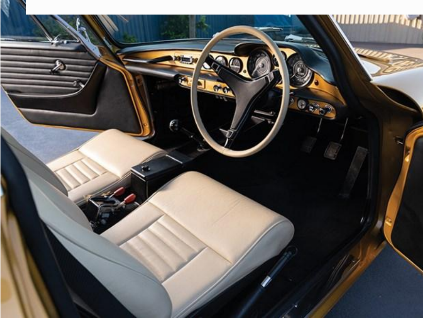
Carmine Carofano Upholstery

"Every single part on it has been replaced or reconditioned. The good thing about this, Povey can put a parts list on an email to Sweden, and you get back what you want seven to 10 days later. That's particularly good, and something you don't always strike even with local makes."