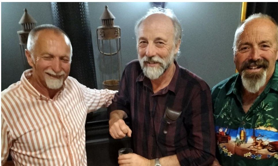
Three Wise Men - from the East.