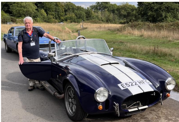
UK 2022 - Cobra Replica

Welcome to 2023 - may it be kind to you.