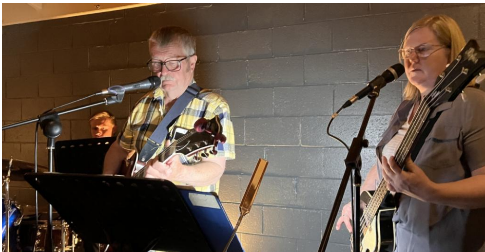
The musically accomplished "Fringe Dwellers" provided music for the audience and dancers.