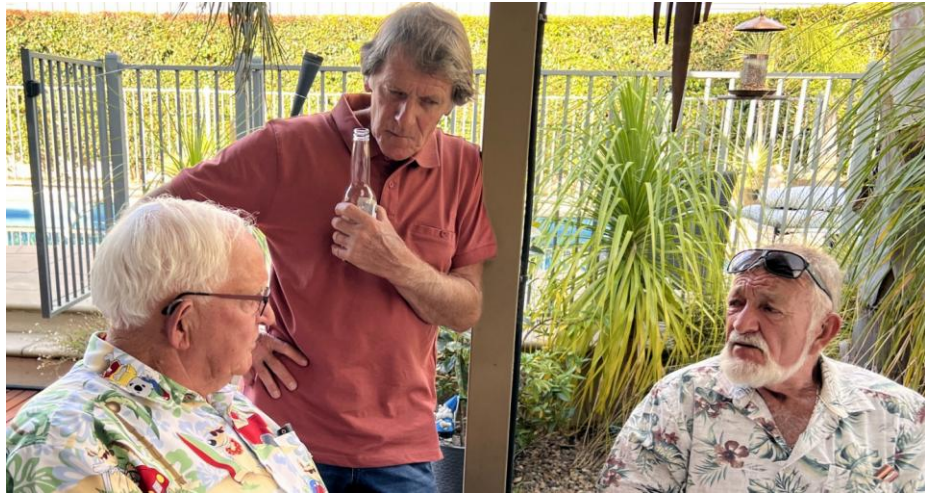
Secret Men's Business!