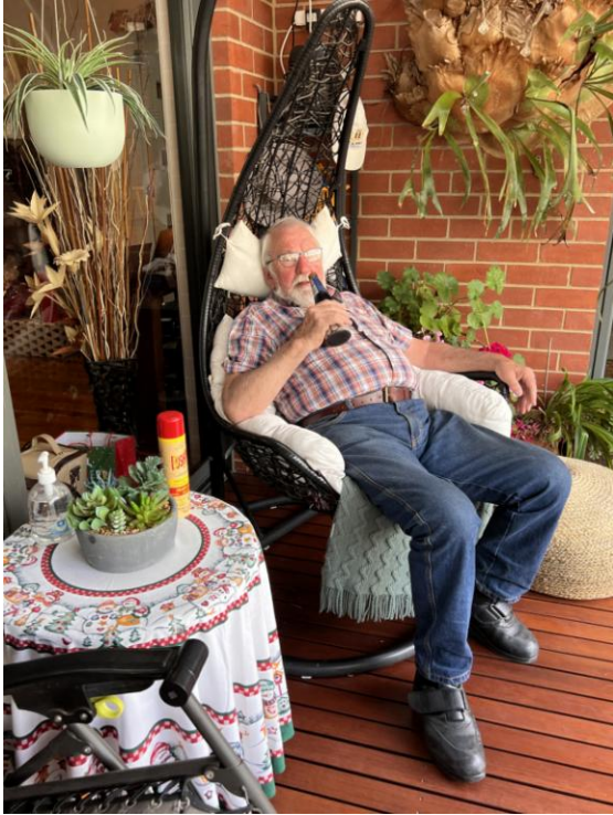
This will do me!