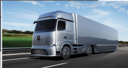
Mercedes-Benz - passenger cars and vans