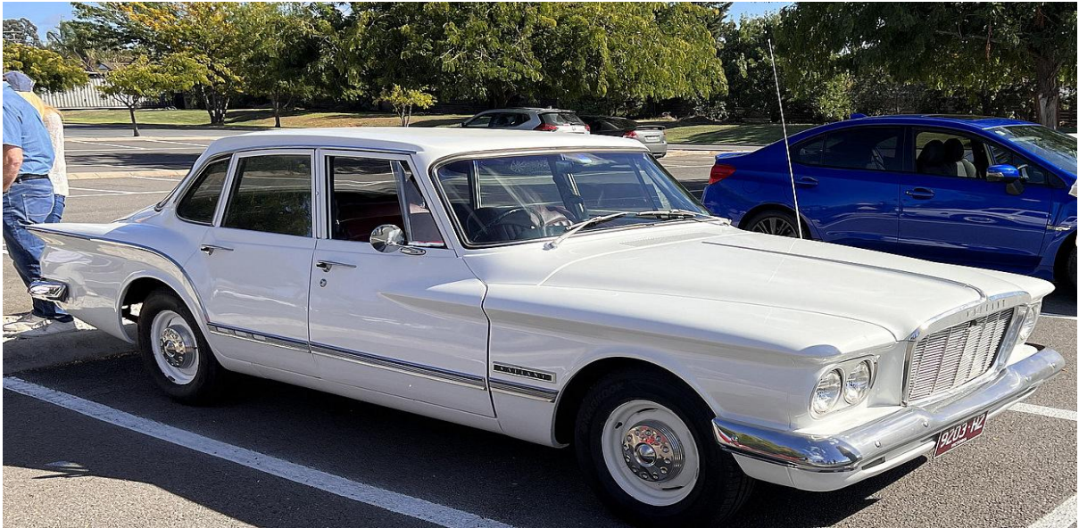
Pristine Chrysler Valiant