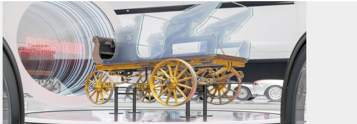
1898 Eggers-Lohner - Porsche Museum Stuttgart

The car is capable of speeds reaching 22 mph and a range of 50 miles, impressive for a vehicle produced well over a century ago.