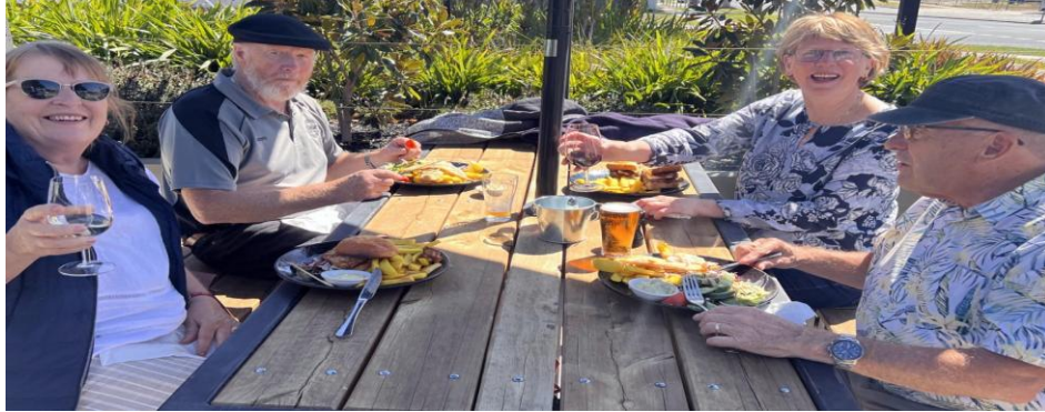
Al Fresco Dining