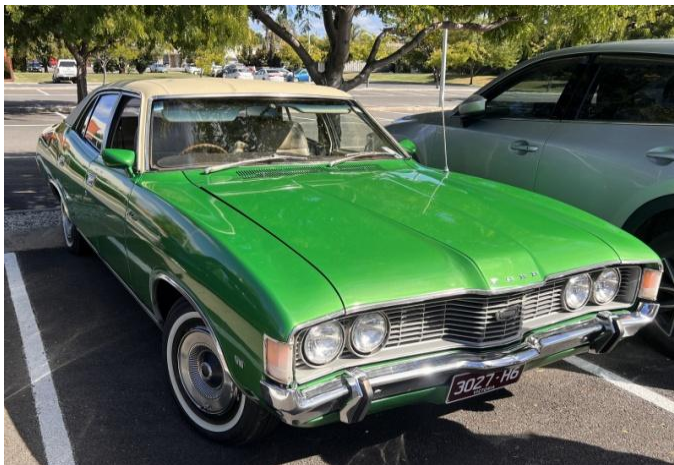
Leader's - Outstanding Ford Fairlane.