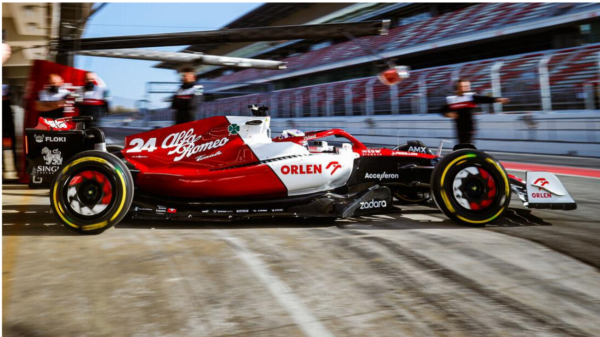
2022 F1. Alfa Romeo