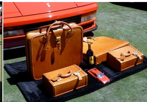
Bespoke Ferrari Luggage