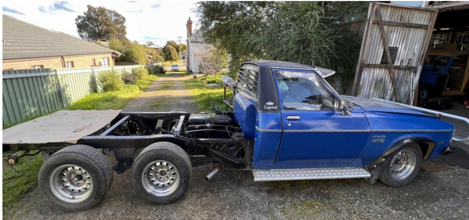
Bob's - Holden Tandem 5 Litre 2 Tonner.