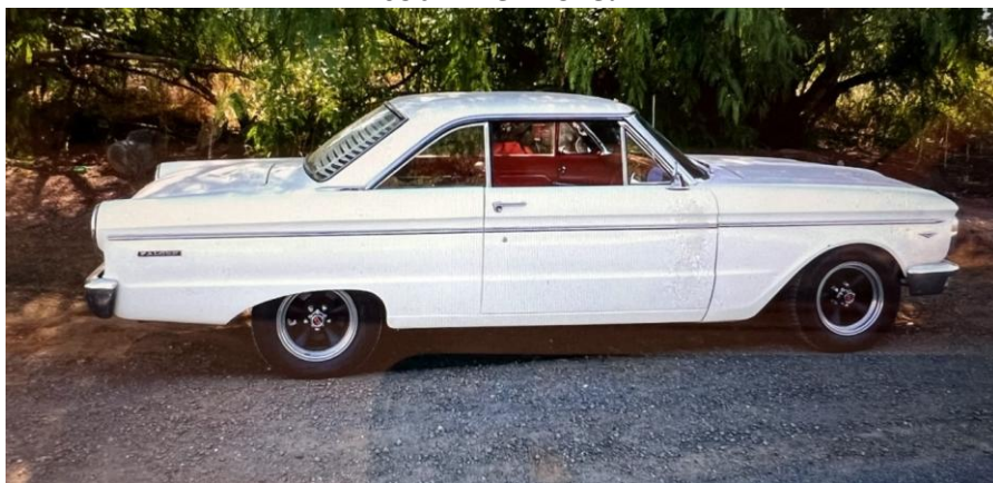
The XP has been on the road for the past six years used for club runs and private trips.