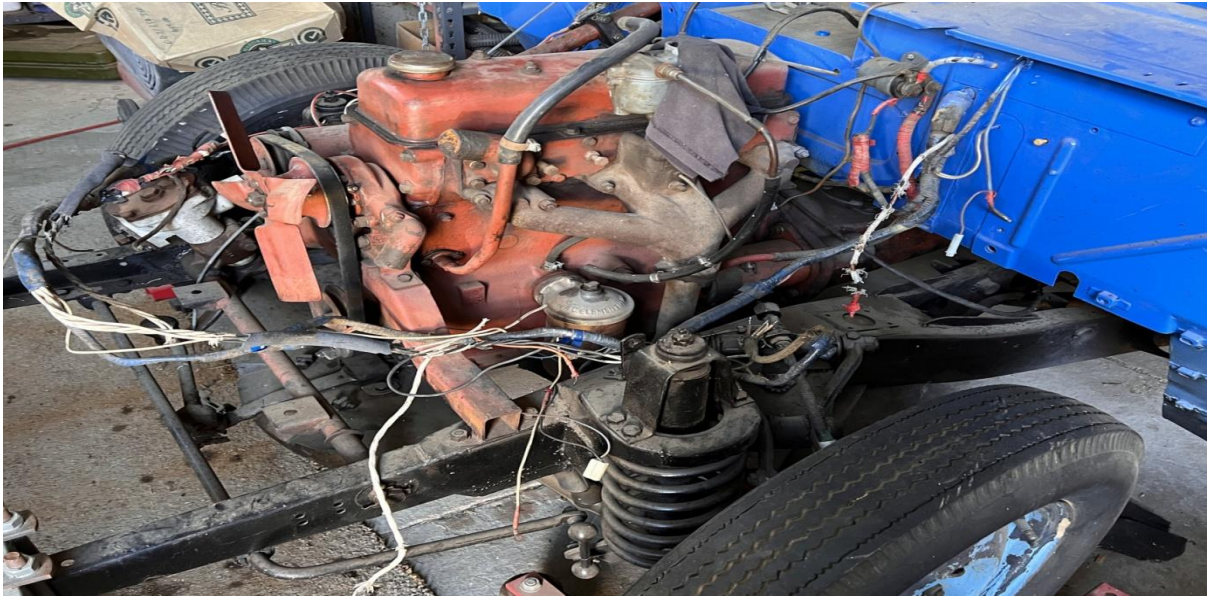
1500 cc OHV Motor.