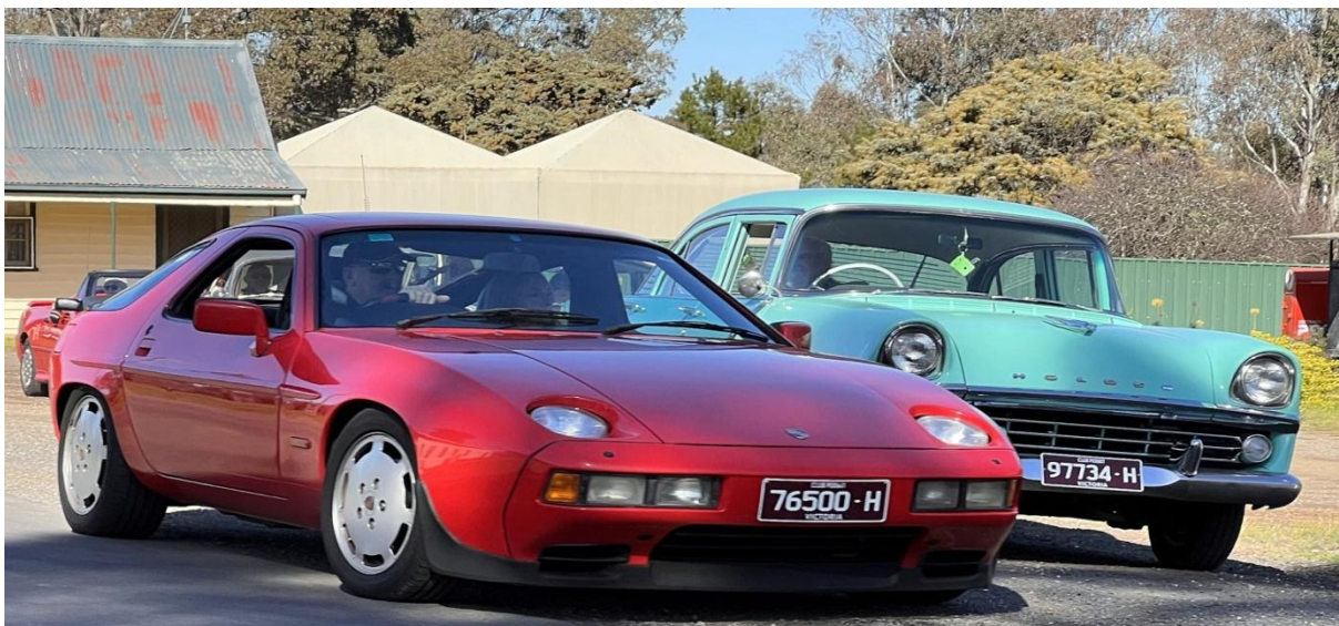
Porsche 928 / Holden.