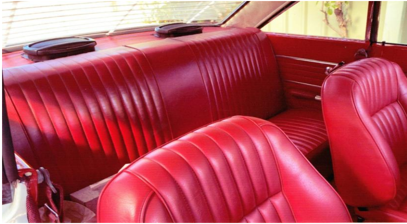
Sumptuous interior: New carpet and bucket seats completed the makeover and Keith's last of a number of restorations.