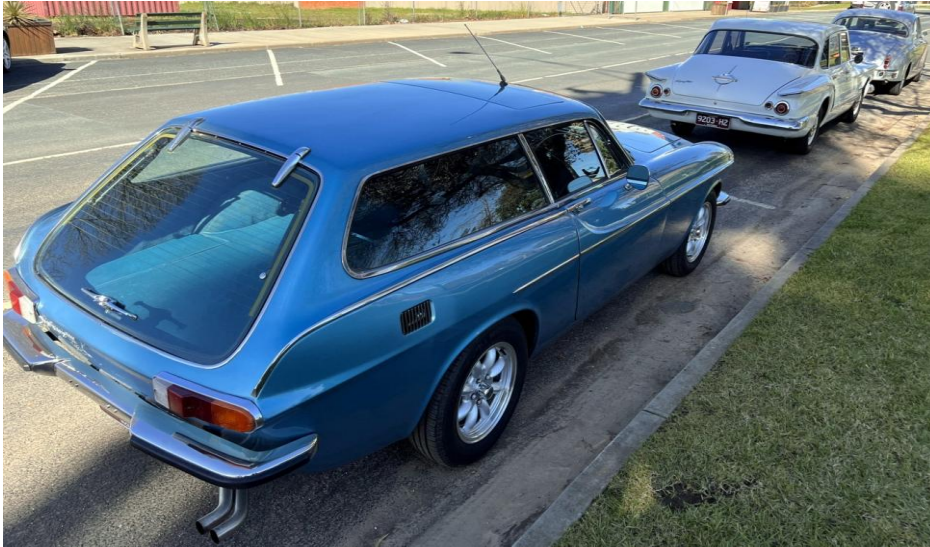
Volvo / Chrysler Valiant