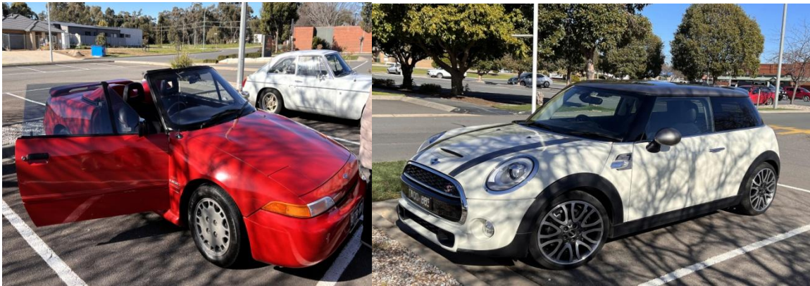
Ford Capri Turbo / Mini.