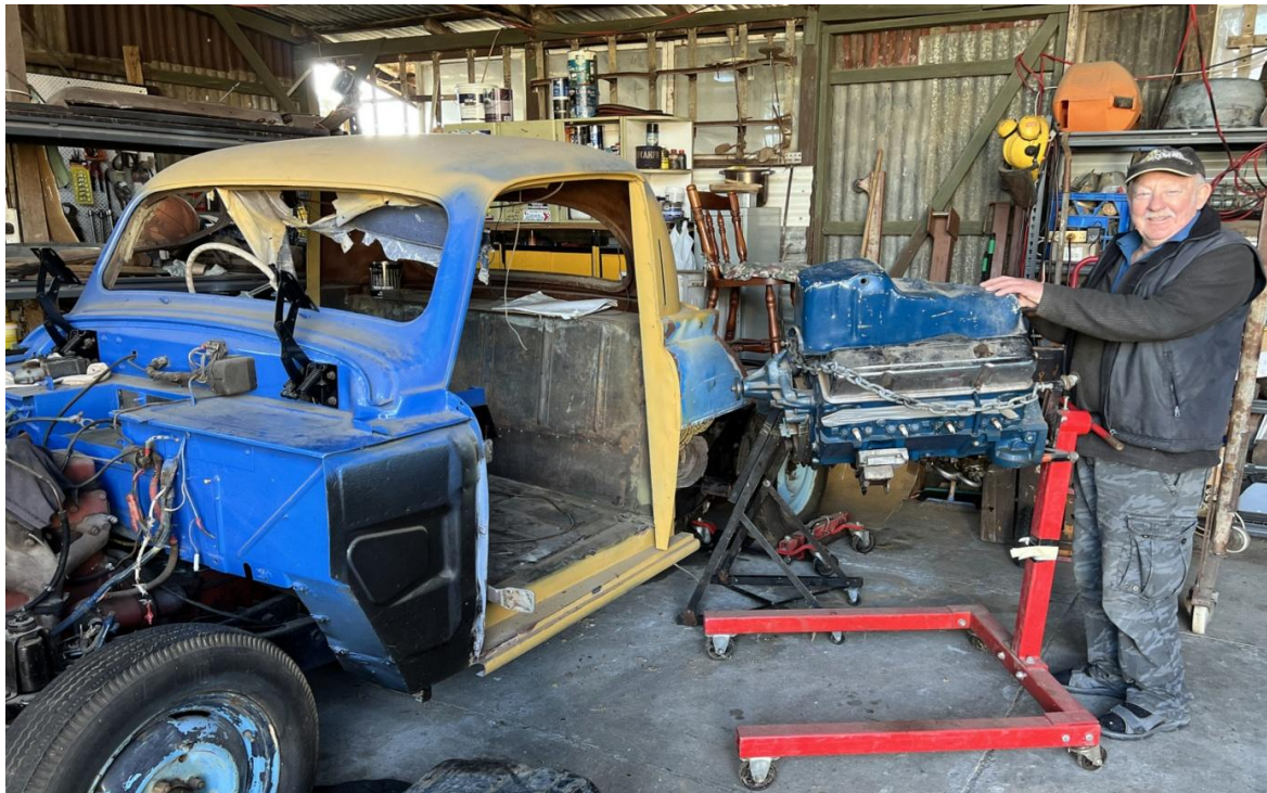
Bob Winterburn Contemplating - What's Ahead.

This vehicle has a very interesting and advanced for its time - independent front suspension. It's a coil-over shocker arrangement, with very light wishbones - apparently to reduce unsprung weight. Singer cars had independent front suspension as far back as the 1930s! The steering mechanism is also interesting taking a circuitous route using 2 unequal track rods.