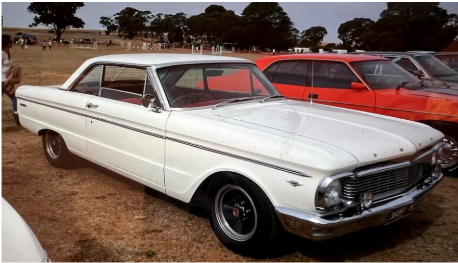
Job - Well Done!