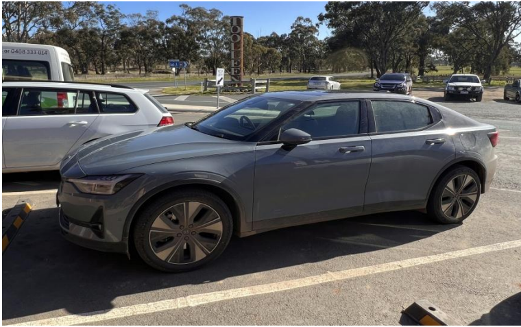
Polestar E.V. (Volvo)