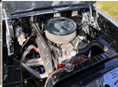
350 V8 Holden