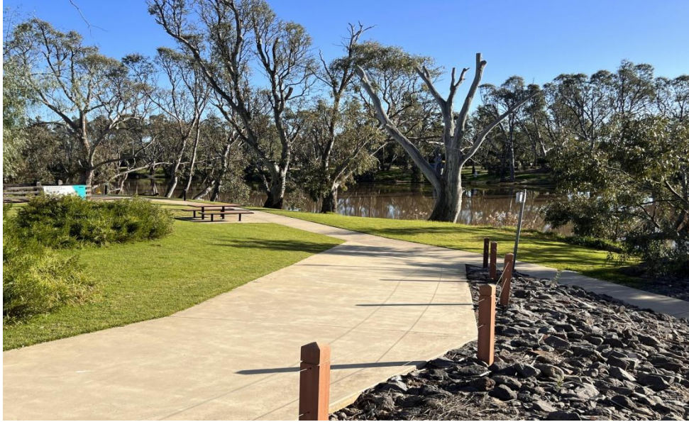
Beatification Walk - along River