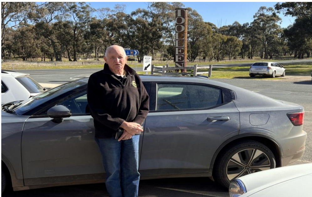
Roger couldn't help being drawn by the magnetism of the E.V.

The pub is quite rustic, but appropriate to its country location. It is also the unofficial hub of the Mount Pleasant Football Club and the only watering hole for kilometres.