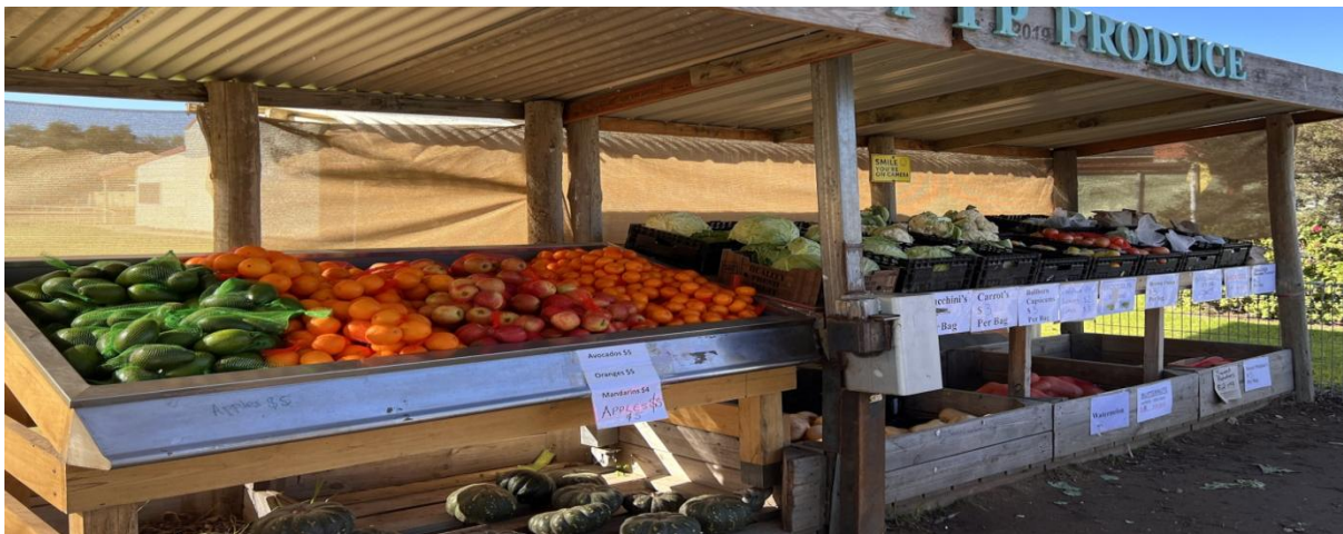
Self-Serve - Fresh Food Stall

Cobb & Co also used the crossing below the town enroute to the goldfields. By the year 1876 when the railway reached Bridgewater; there were two Flour Mills, a Cheese Factory, Soft Drink Factory, Brewery & Hotels, several Blacksmiths, 3 Churches, School, Chinese