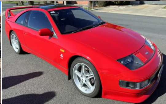
Nissan 300 ZX