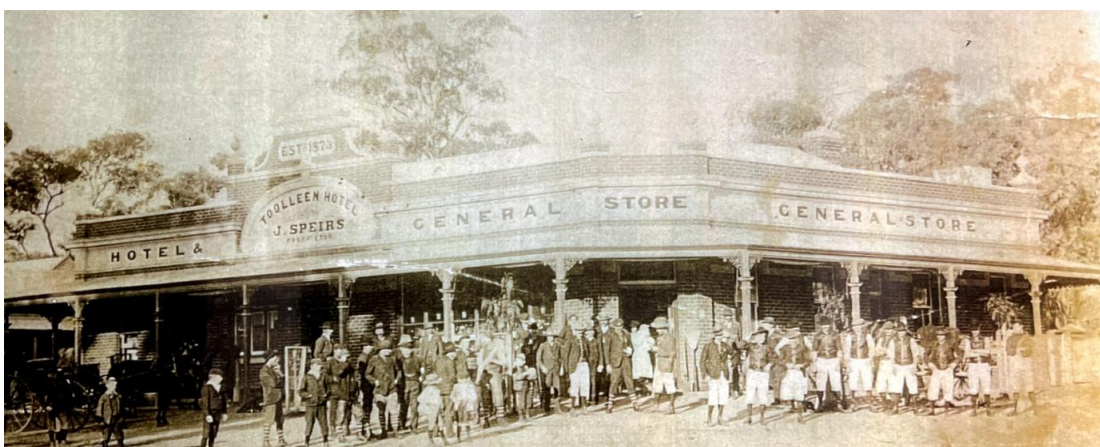
Tooleen Hotel and General Store - early 1900s