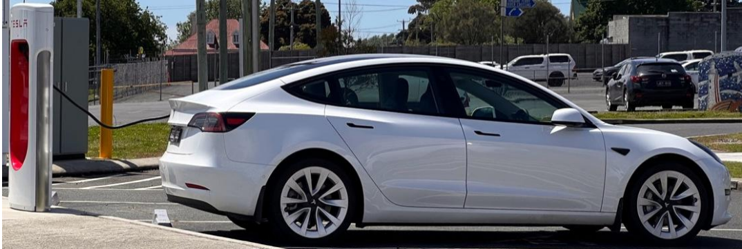
Club Tour to Tassie: 11 November 2022 - Devonport Tasmania after 1700 Kms. Note: Short cord!