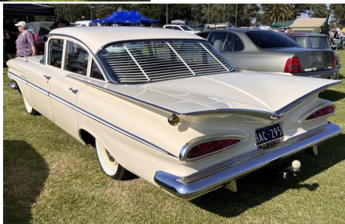
Chevrolet Bel Air