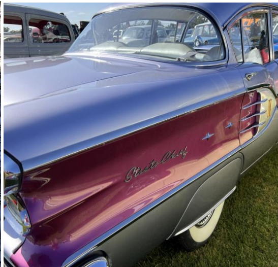
Pontiac - 1950s Excess!