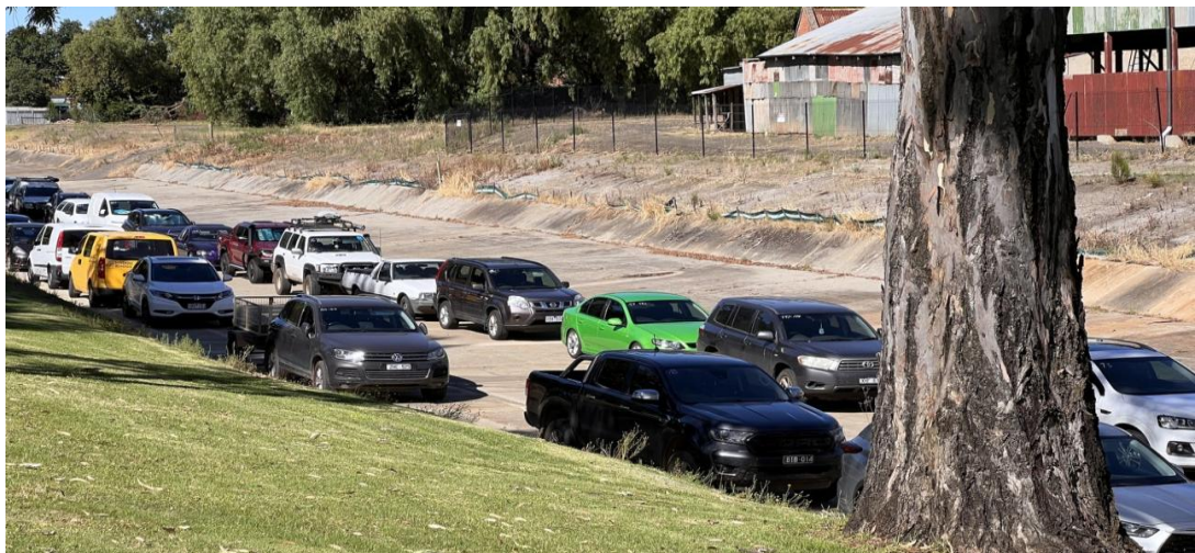
An Unusual Site - Bendigo Creek Parking