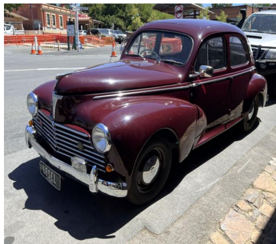
Le Sel 's 1950s Peugeot 203 - a car that was very successful in Round Australia Reliability Trials in the 1950s. Well engineered and sturdy and a decent drive.