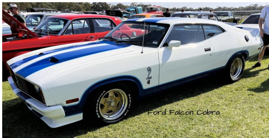
Ford Falcon Cobra