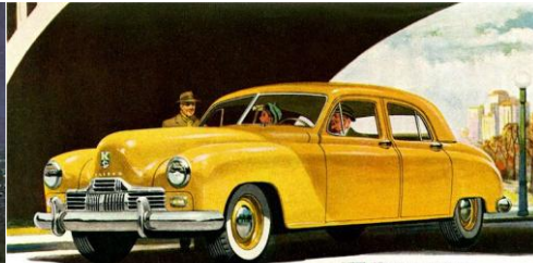
KAISER SPECIAL PRODUCT OF KAISER-FRAZER

Take a moment to take a look—would you want to take an hour to admire all the new luxuries and advancements in these 1949 Studebakers. It's a Studebaker year again all over America!