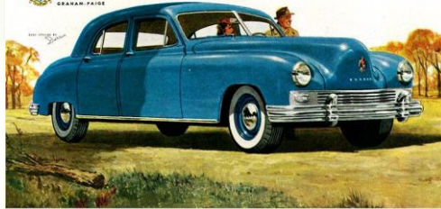
FRAZER PRODUCT OF GRAMM-TRAISE

THE KAISER SPECIAL and the FRAZER look like what they are—the most exciting things on wheels! Their long, low, road-hugging lines mean smartness, comfort and safety. Their styling and engineering have set the trend for the industry. And they give you a ride that's a revelation—the result of improved distribution of mass and load. Those lucky people who have taken delivery will tell you that performance as well as design has been vastly improved since 1942.