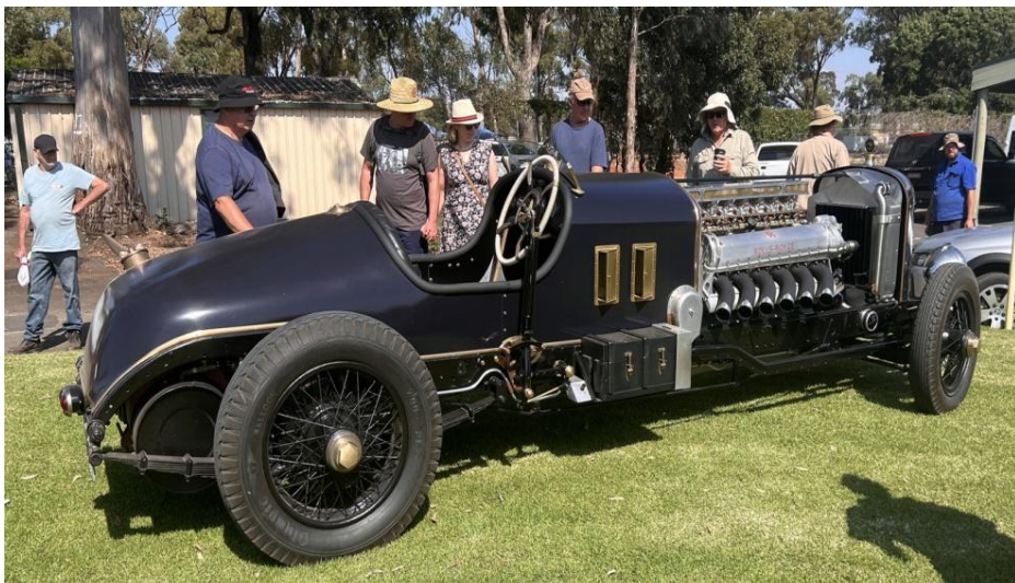
Rolls- Royce Special