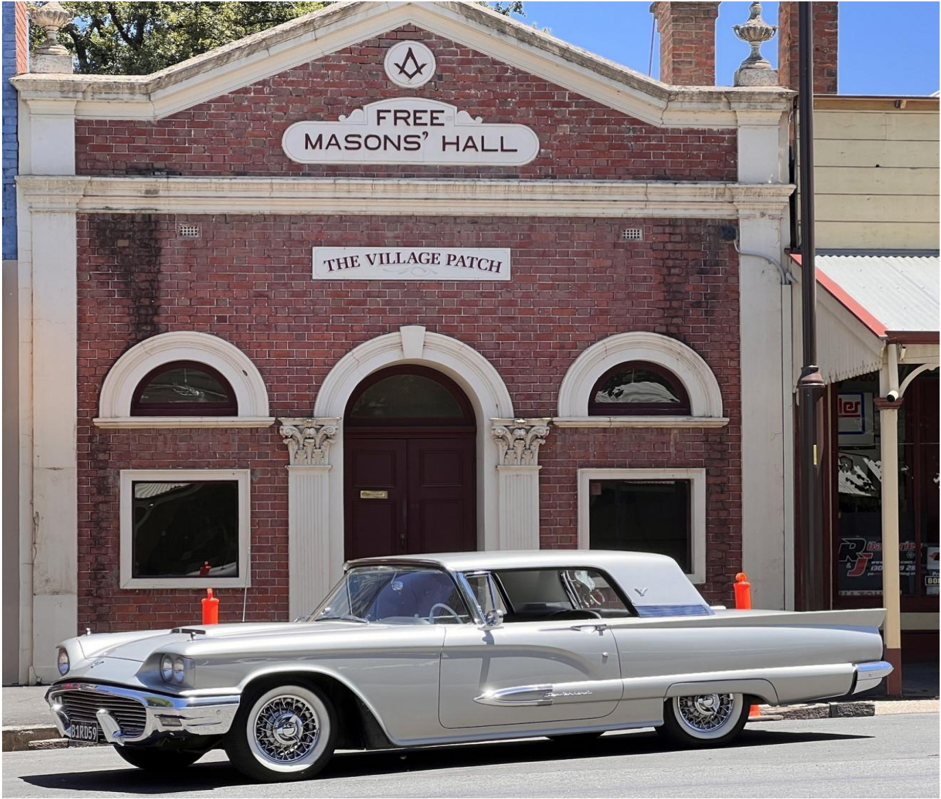
Ford Thunderbird 1959