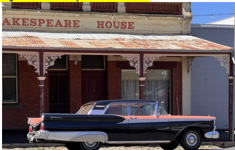
Impossible to miss - taking up two parking bays - Ford Fairlane 2 Door Hardtop c.1958