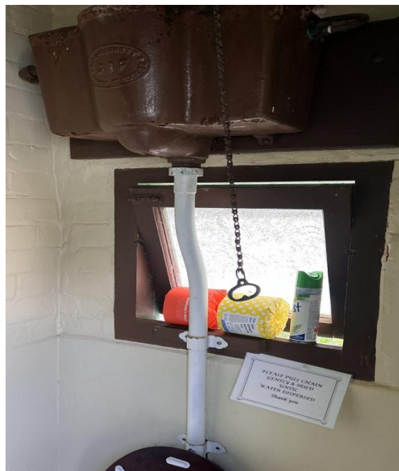
Don't Forget - to pull the chain!