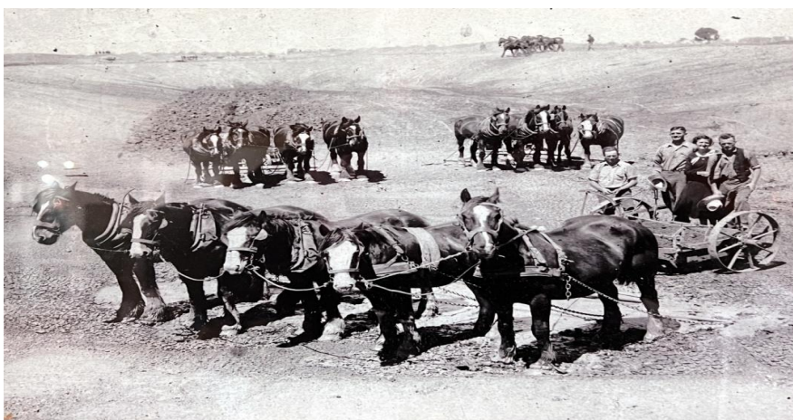
Pioneers - constructing Irrigation Channel.

After the severe drought of the 1890s in Victoria, there were multiple attempts to create irrigation schemes for the state.