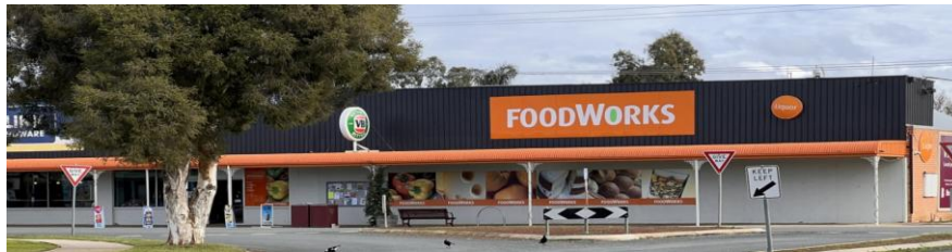
Hardware / Supermarket / Bakery

In a few years after the construction of the irrigation system, the Elmore to Cohuna railway was completed in 1915 to help facilitate economic growth in the area..