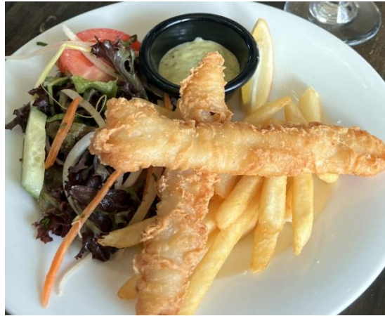
Fish and Chips

So, the Wednesday run had a twofold purpose for our patronage and that as to support a worthwhile small local country town keep its independence.