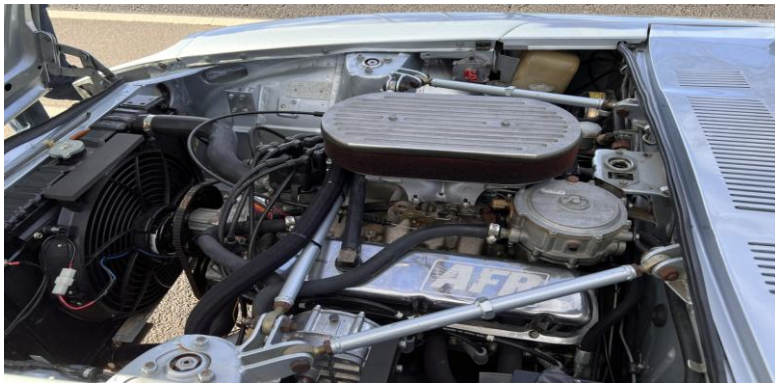
Car fitted with 302 Ford Windsor V8 T5 Manual Transmission