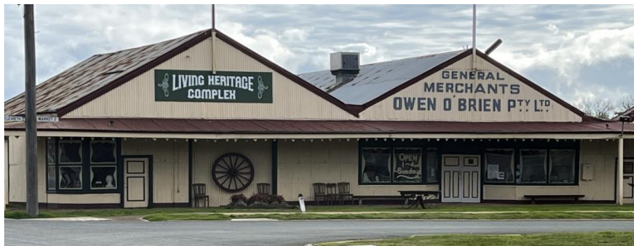
Lockington Heritage Centre