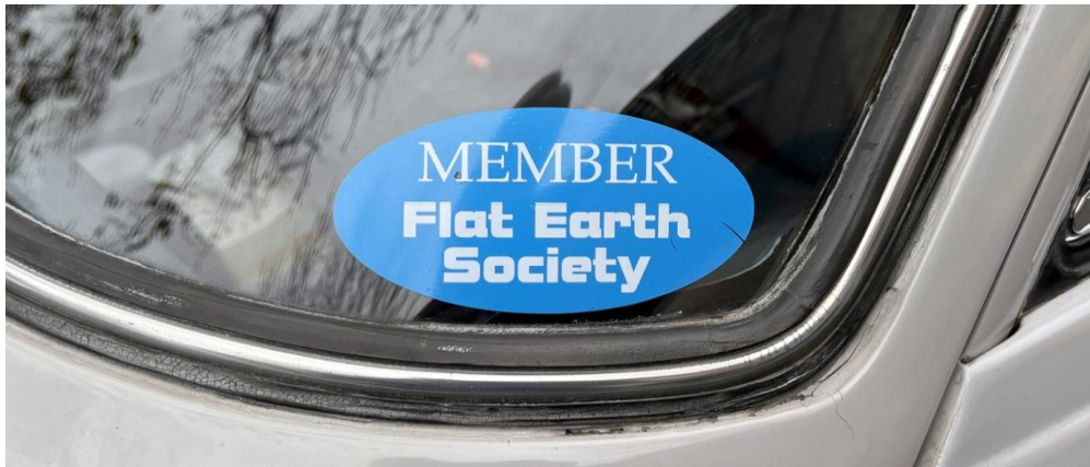
Pasted on a Valiant