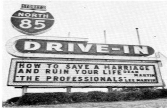
Imposing roadside marquee (above) with huge illuminated arrow points way to two boxoffices at Storey's enlarged North 85 Drive-In, in Atlanta, helps speed traffic. Ainer offers free windshield cleaning service right behind entrance.