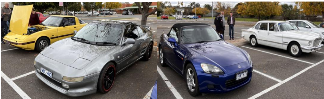
Mazda / Toyota