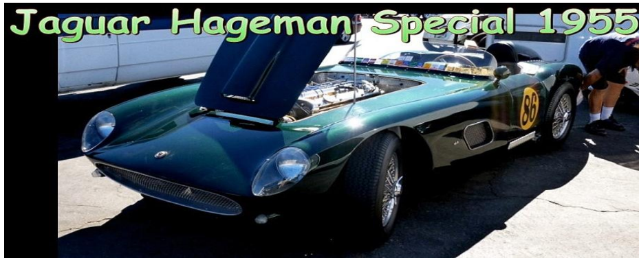
Jaguar Hageman Special 1955