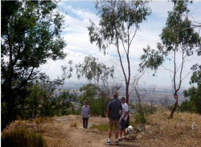
From Mt. Alexandra - View to East.

We then headed off down the mountain to Faraday and via the quaint little town of Chewton to Das Kaffee Haus in Castlemaine, with its Viennese theme and efficient service, for lunch. A really successful run of about 90 minutes, with an eclectic range of vehicles, through a variety of landscapes.