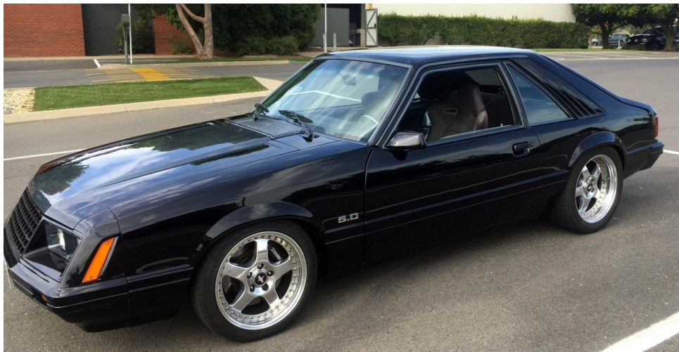
The Presidential Mustang