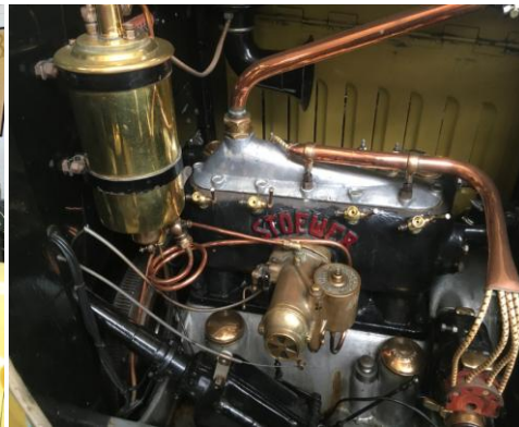
1923 3A 1922 D5 1924 D5/79 (RH)