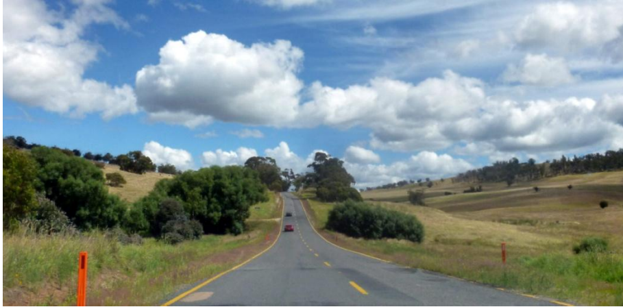
Toward Dinner Plain