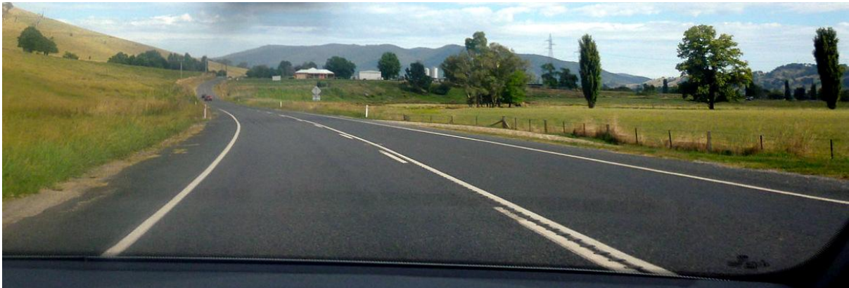
Beautiful Kiewa Valley