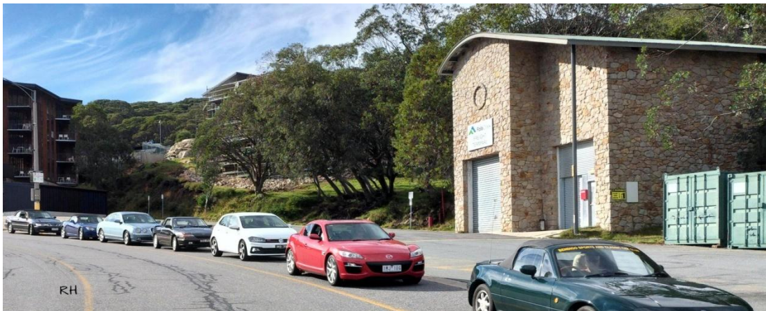
Falls Creek - (RH)