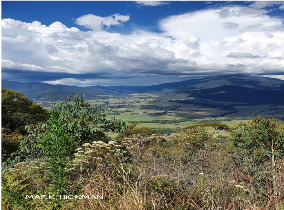
Magnificent High Country