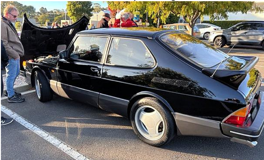
Saab Turbo - "Black Betty"