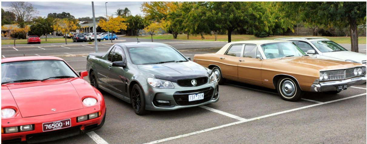
Porsche, Holden, Ford Galaxie