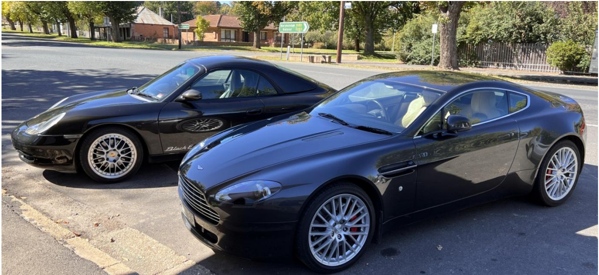
Porsche 911 / Aston Martin Vantage