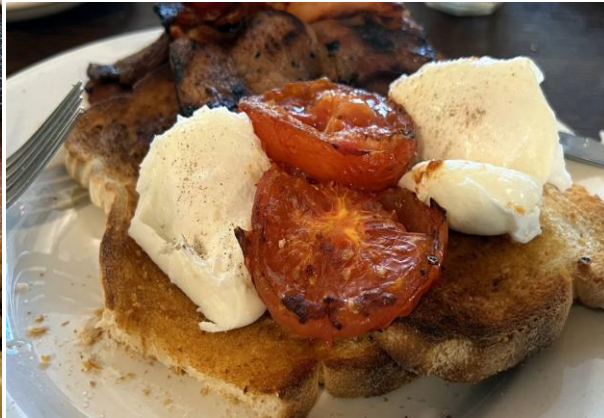
Bacon, Eggs, Tomatoes