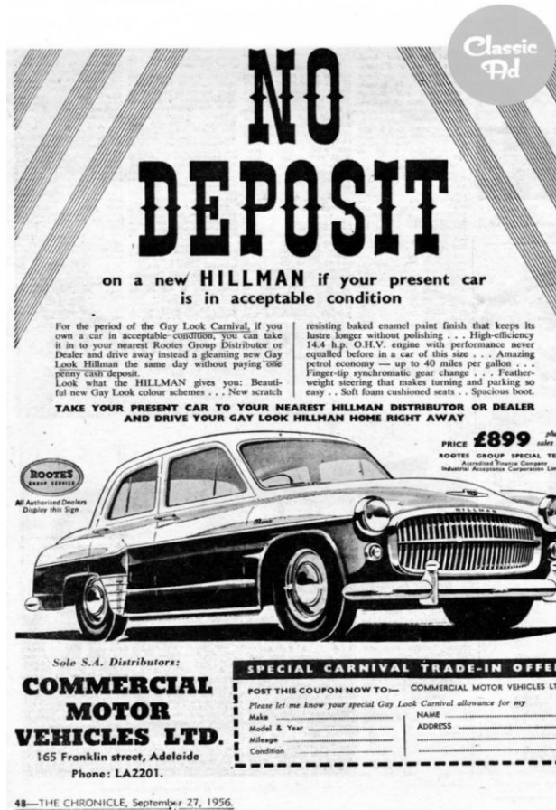
The "Gay Look" Hillman Minx 1956