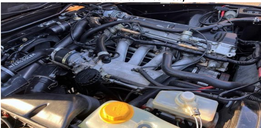
The Beast's Engine