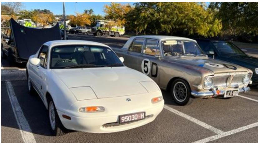
Mazda MX5 / Ford Zephyr

A good roll up for an early start at 8 am (23) Heading for Marong, out through the backblocks and varying landscapes to Lannacorrie, Eddington, Creswick on through the fertile Moloort Plains, past Cairn Curran reservoir, reaching leafy Newstead, on a beautiful sunny autumnal morning.