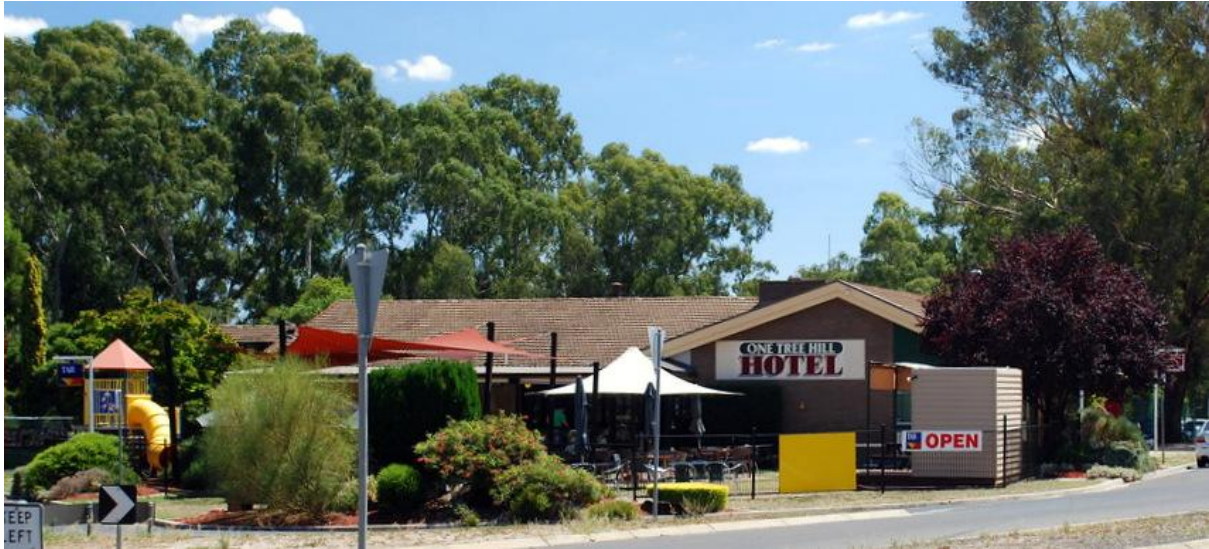
ONE TREE HILL HOTEL SPRING GULLY