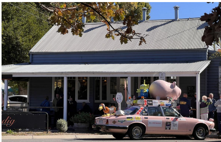
Dig the Pig Newstead

A good roll up for an early start at 8 am (23) Heading for Marong, out through the backblocks and varying landscapes to Lannacorrie, Eddington, Creswick on through the fertile Moloort Plains, past Cairn Curran reservoir, reaching leafy Newstead, on a beautiful sunny autumnal morning.