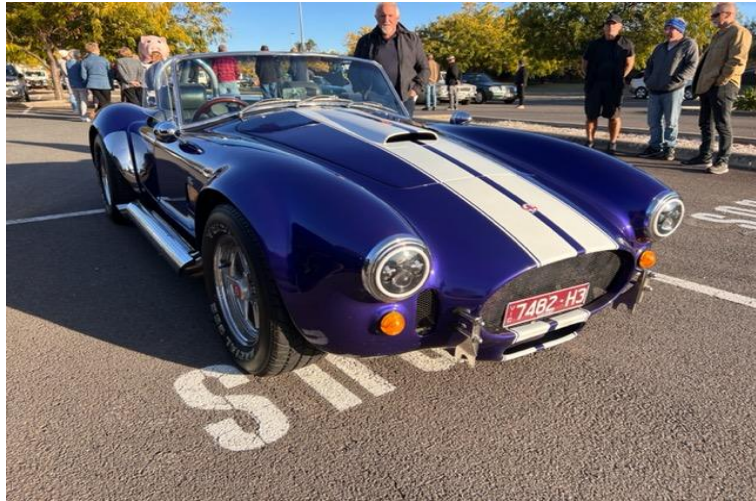
AC Cobra Replica