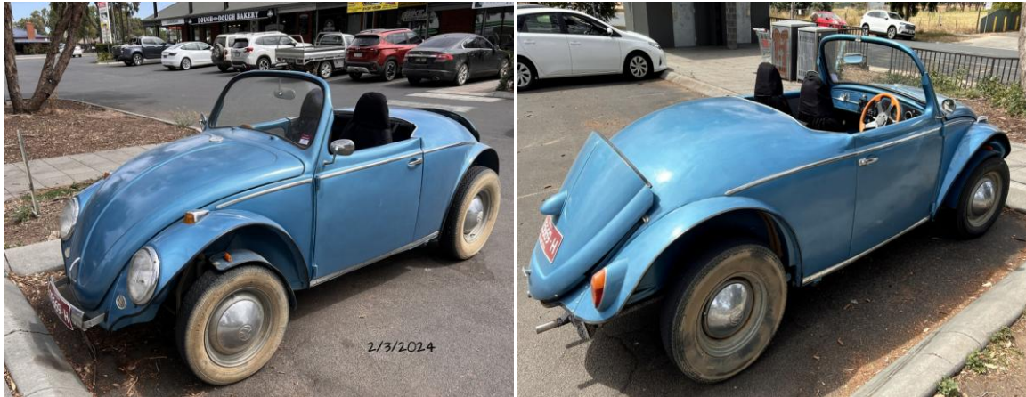
VW Roadster Strathfielsaye

Articulated Boom Lift Haulotte articulated boom lift - for construction, maintenance, renovation, and pruning, sporting and other events.