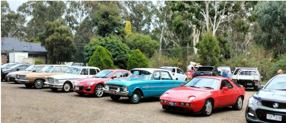
A Great Variable Collection of Club Vehicles