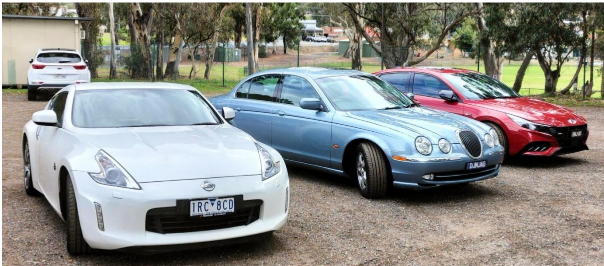
Nissan, Jaguar, Hyundai