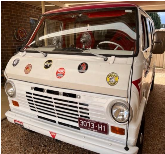
Ford Econoline E300302 cubic inch C6 Auto Full floating rear axles 5 seater- Great tow vehicle