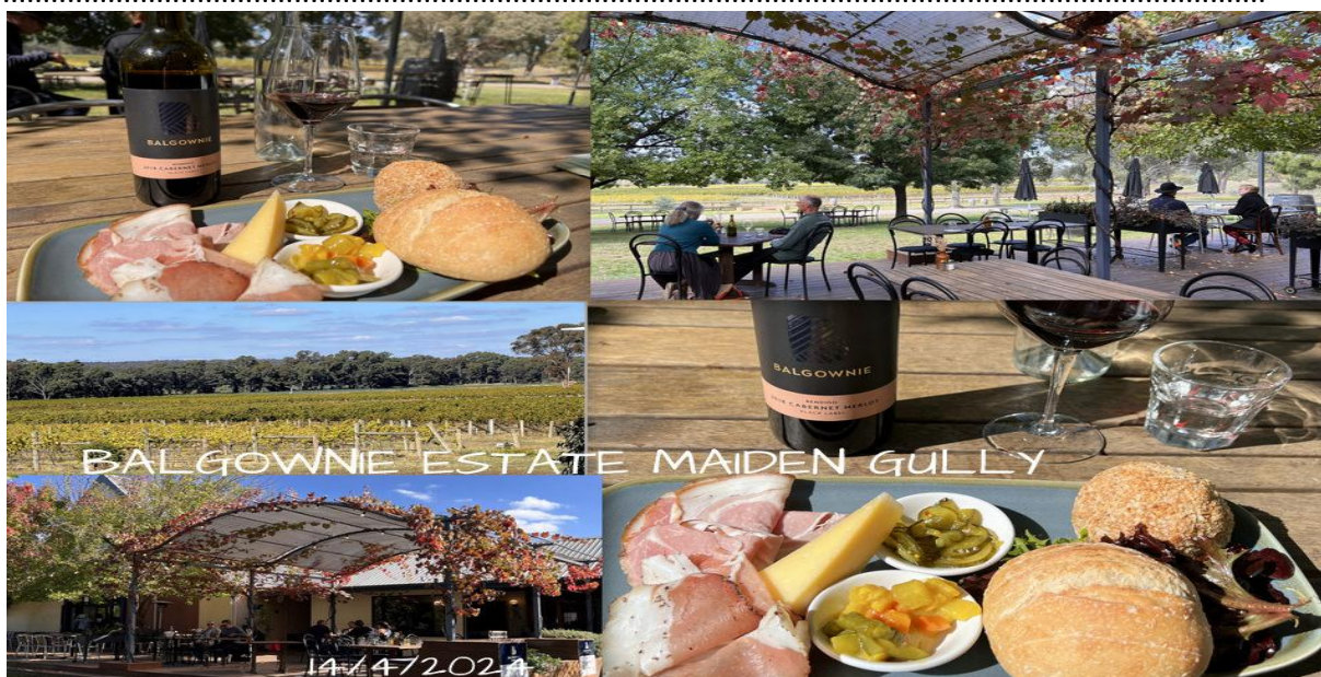
Ploughmans Lunch - From Cellar Door

A number of homes have been destroyed or severely damaged - as reported in the media -- obviously at the cheaper end of the market - where standards are very low.