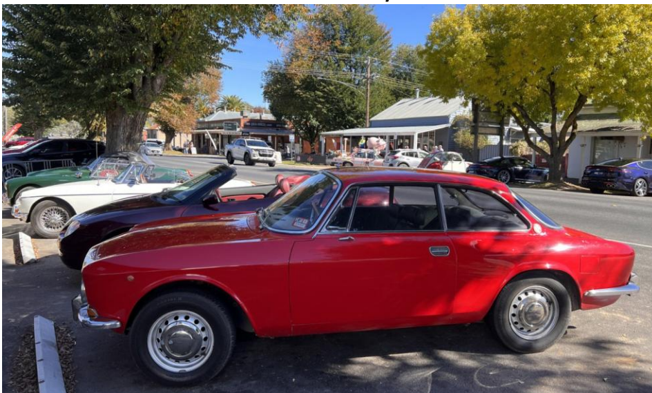
Alfa Romeo 1750 GTV