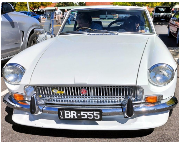
MG B GT