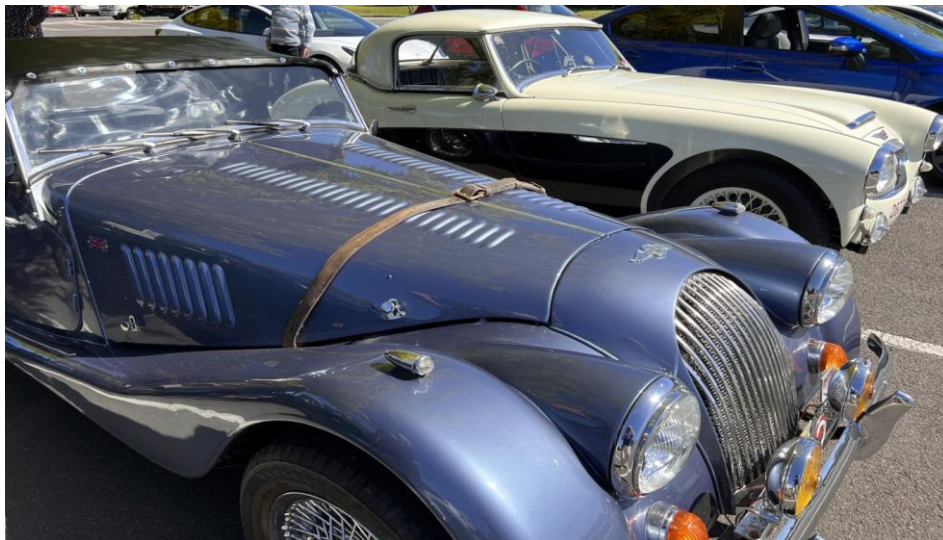
Morgan / Austin Healey