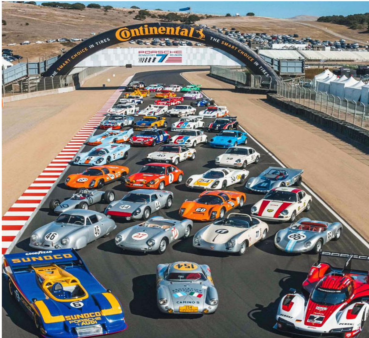
Porsches at Laguna Seca U.S.A. (Internet)